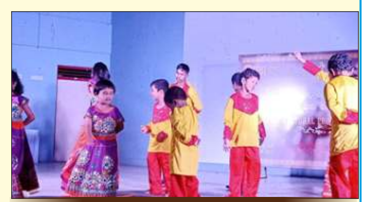
Bandhavya at Suttur in 2019